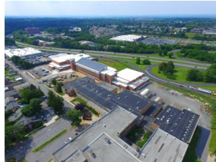
Nitschmann Middle School 230,000 SF New school followed by demo of old