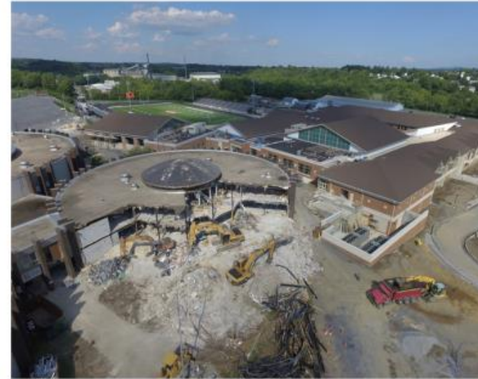
Northampton Middle School 260,000 SF New school followed by demo of old