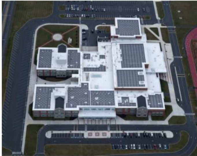
Nazareth Middle School 250,000 SF New school