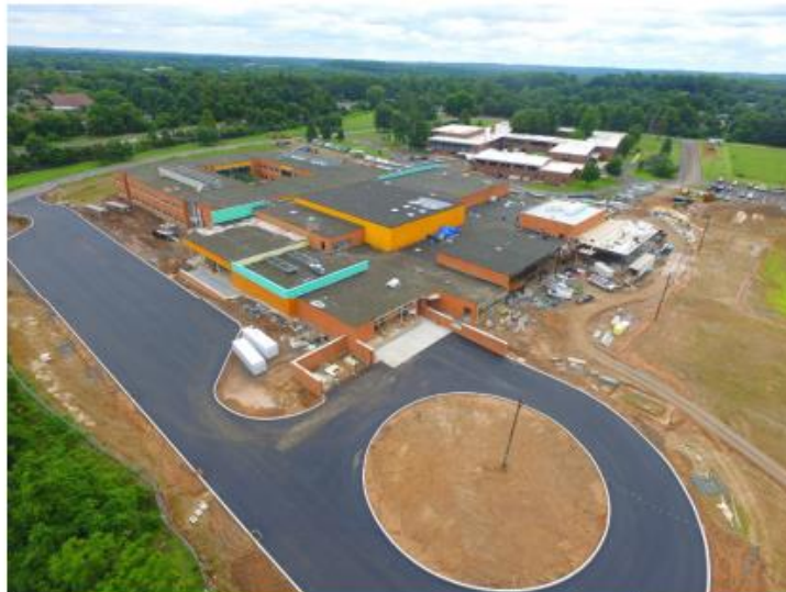
Newtown Middle School 260,000 SF New school followed by demo of old