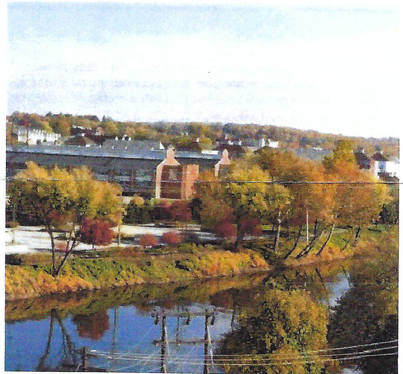
Schuylkill River in Conshohocken.

Additionally, information can be found on our website https://www.conshohockensa.com/ and social media @ Borough of Conshohocken Authority (Facebook).